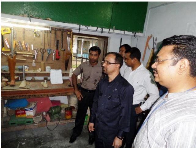
NGO Bureau Director visiting Assistive Device Section

I am really very delighted to visit DBLM Hospital at Nilphamari. This hospital is an unique institution in Bangladesh. This Hospital is an example of service of humanity. I am extremely impressed and excited to see that Doctors, Nurses and all the staffs are working here with highest level of devotion, affection and commitment. I learned a lot from this regarding service to the humanity. As Director General of NGOAB, I feel proud of them and I am also grateful to Almighty for giving me the opportunity to work with them. I pray for their success. May all help them in their all Endeavour.