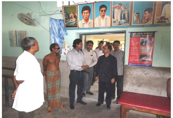
NGO Bureau Director visiting Physiotherapy Section