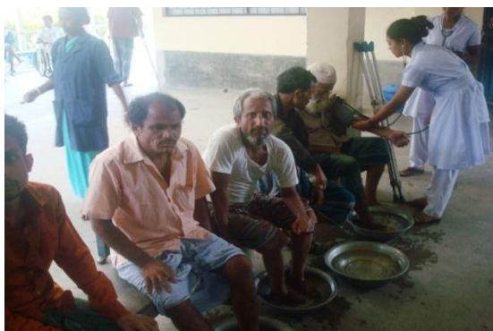
Newly joined Senior Staff Nurse helping the ulcer patients

The project initially lacked budget shortfall which was later being supported by TLM EW. Program Leader was not physically in support for the hospital, as a result decision were delayed to be implemented in some cases. Research initiative like "Surveillance for primary & secondary drug resistance in leprosy in Bangladesh" and Proposal for Thalidomide use for reaction is under way through the hospital program.